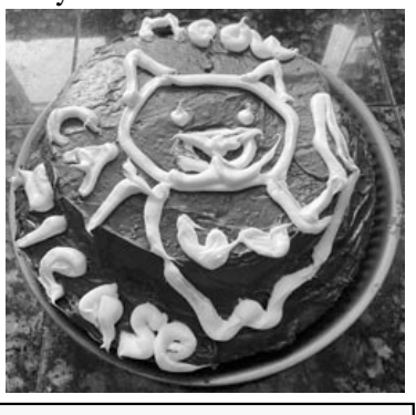
The Front Range Diet™ is not cheugy in the least.