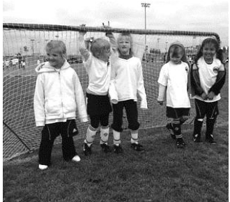
The Mighty Dolpins execute their trademark goalenaccio move